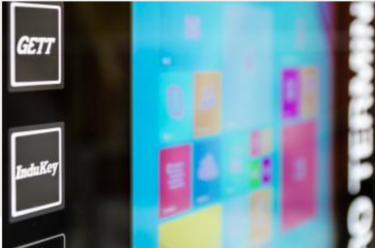
Backlighted glass touchpanel with integrated projective capacitive touchscreen and single capacitive switches

The general trend towards differentiating technical systems dictates our adaptation work on the necessary components. Any systems, which are manufactured exactly to meet a customer's needs in small, medium or large batches, automatically require individual data input devices too.